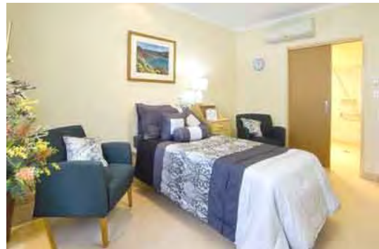
Single Room – Modern Private Ensuite