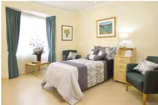
Premium Single Room – Modern Private Ensuite