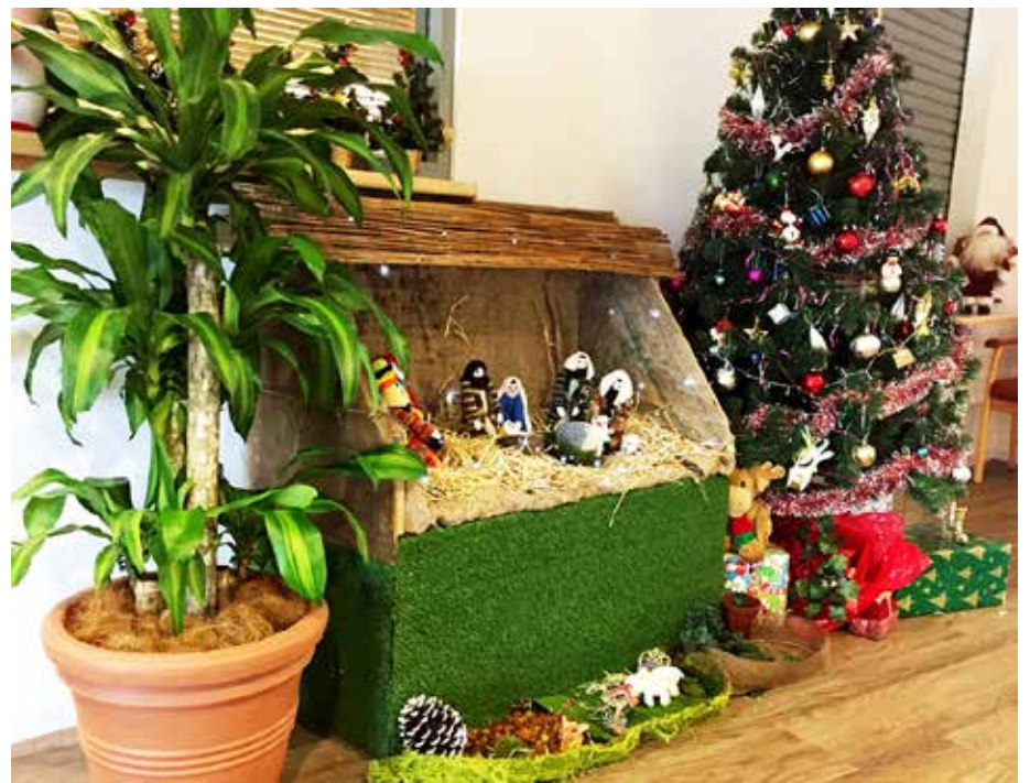
Above (from top): Diwali celebrations at Resthaven Leabrook; The annual Resthaven Craigmore knitted nativity scene, which takes pride of place each year in the foyer. Merry Christmas to all!