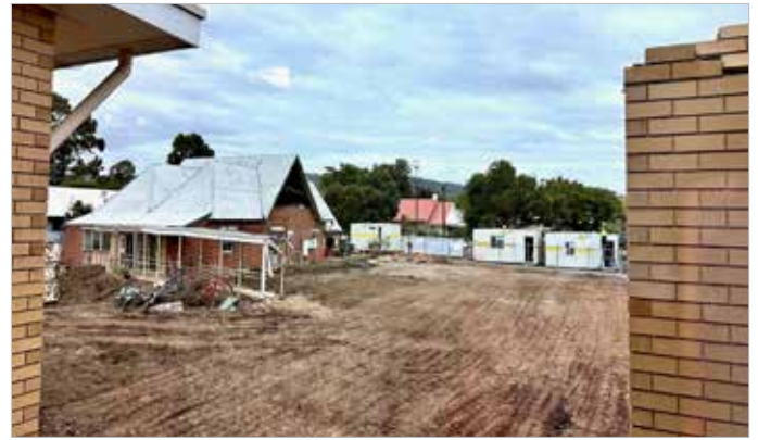
Above: The cleared site at Resthaven Westbourne Park, ready for construction to begin.

It will also include refurbishment of the Marlborough lounge and dining areas, and improvements to all gardens areas.