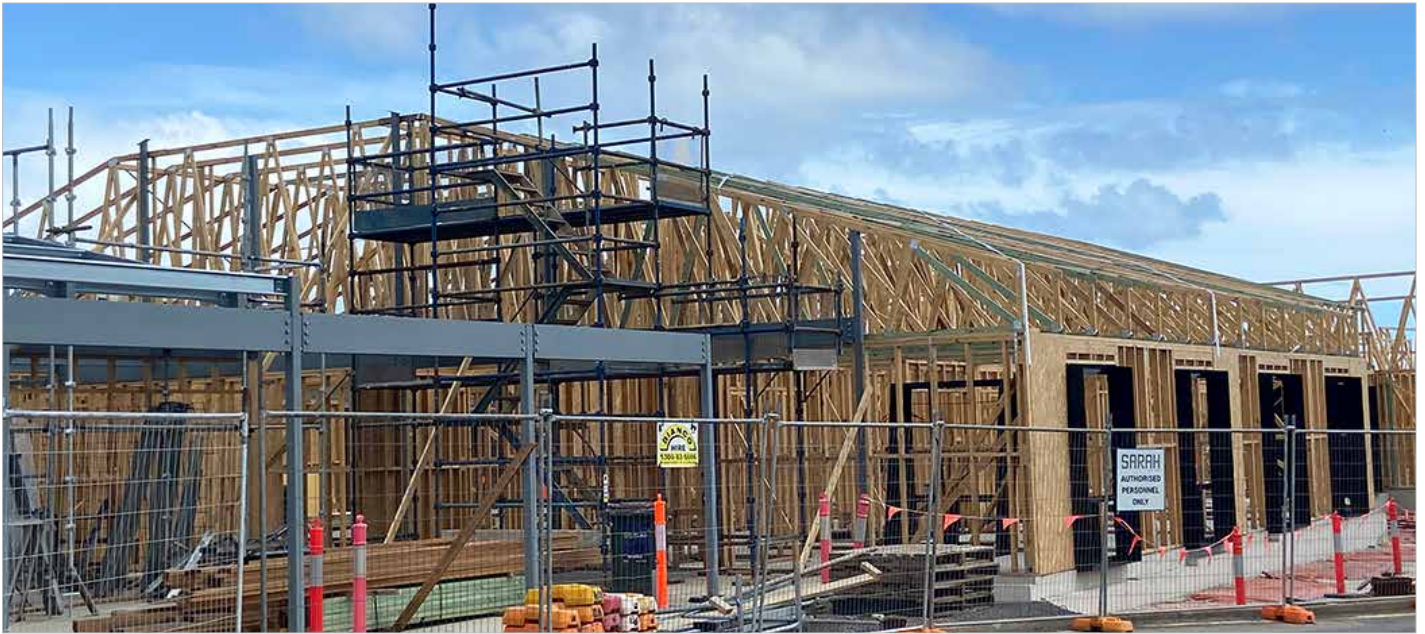
Above: Super structure under construction at Resthaven Bellevue Heights.

Fitout works have commenced on the new premises, which is a former ANZ bank branch. It is very prominent on the junction of Main North Road and Regency Road, and you can't miss the Resthaven logo on the large sign if you drive past! (pictured)