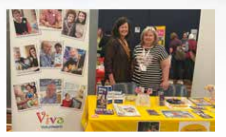
Above: Volunteering Expo in Kilburn.

Working Together (Values and Communication), Self-Care (Mindfulness, Movement), Work Health and Safety.