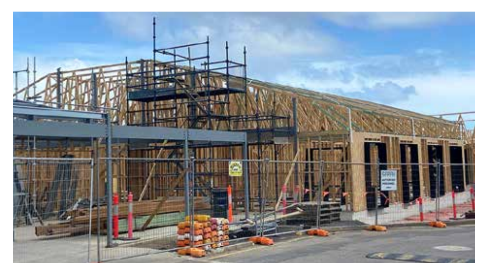
Above: Super structure under construction at Resthaven Bellevue Heights.

Stage 1 includes the construction of 42 new rooms, to replace old rooms in Hampton and Richmond. Stage 2 will commence in February 2024.