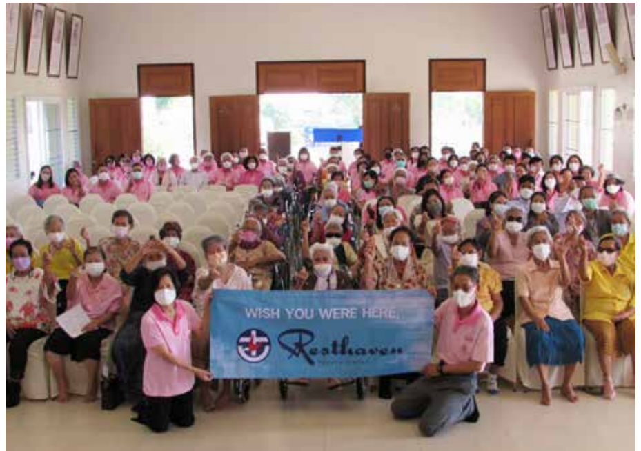
Above: Baan Sudthavas residents, volunteers and staff display a banner for Resthaven.