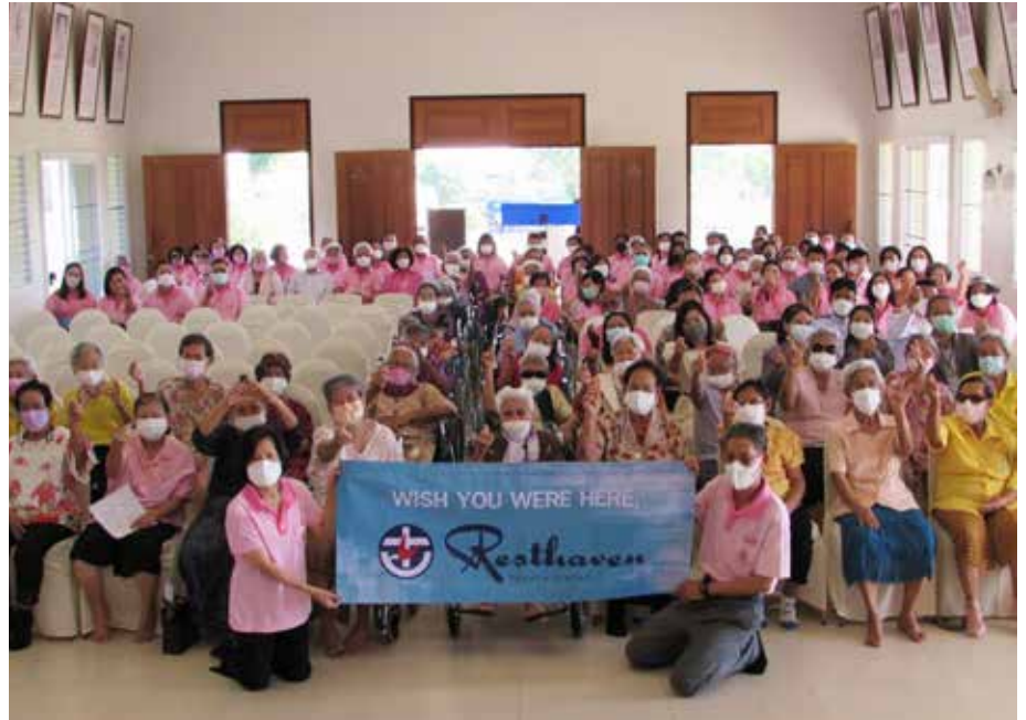
Above: Baan Sudthavas residents, volunteers and staff display a banner for Resthaven.