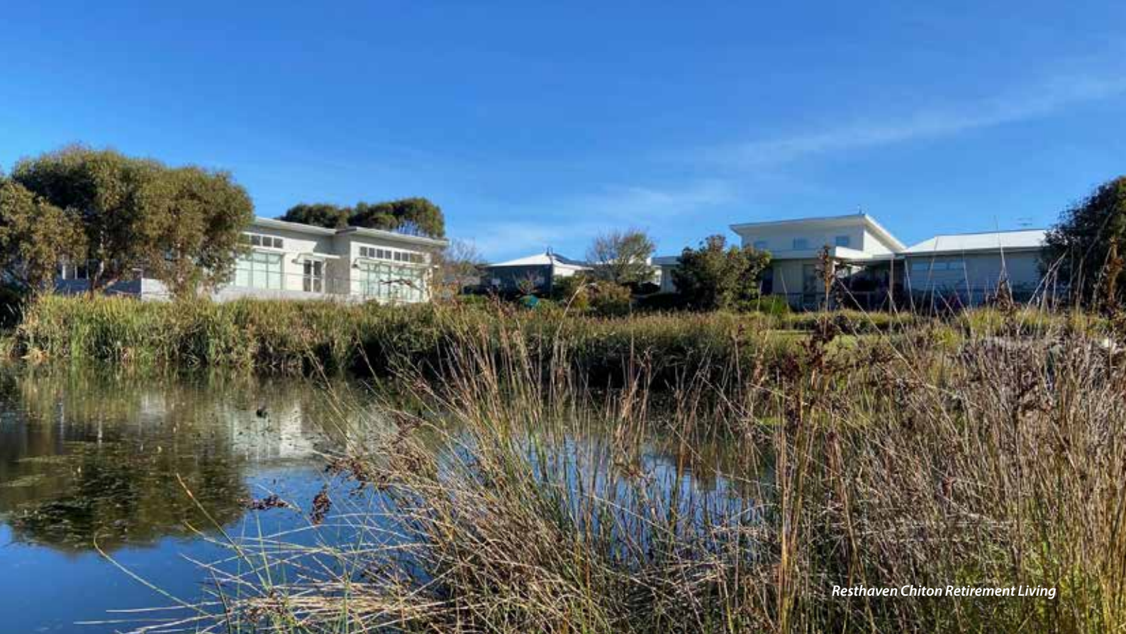
Resthaven Chiton Retirement Living