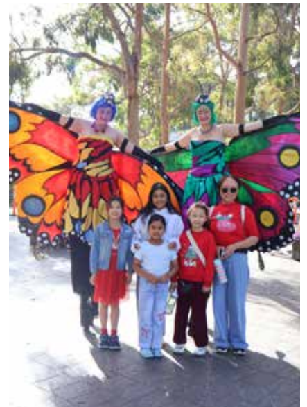
Below: Attendees at the Adelaide Zoo 'thank you' event with butterfly stilt-walkers.