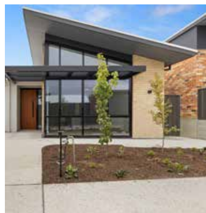
Above: The beautiful new homes at Resthaven Chiton Retirement Living.