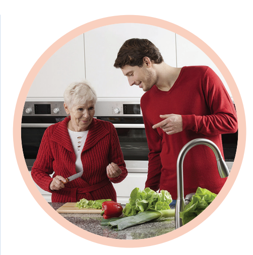
Trust Dignity Choice